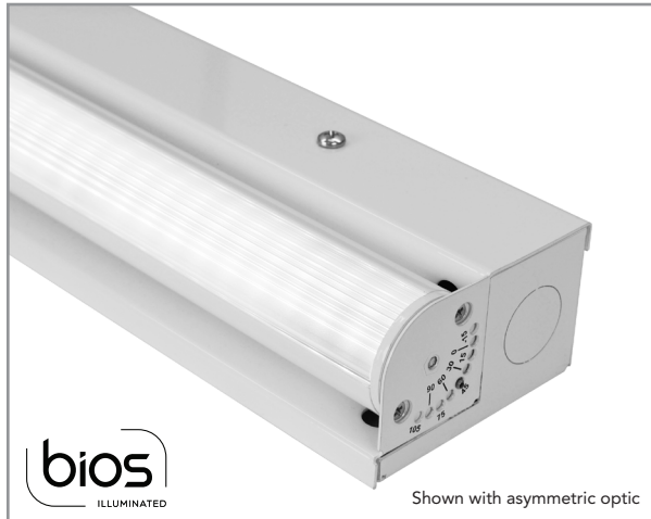
Shown with asymmetric optic