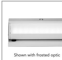
Shown with frosted optic