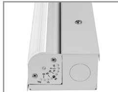
Shown with asymmetric optic