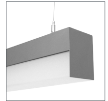
BLT215 | 4" x 3-1/8"